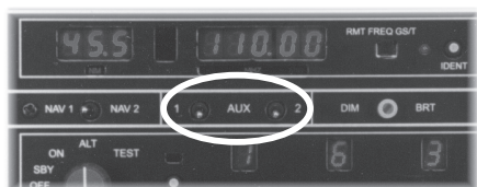
AUX 1 & 2 toggle switches

The AP-3000 is designed to be similar in operation and function to common avionics stacks found in actual aircraft. With few exceptions, its use should be intuitive and integrate easily with any system. A few functions unique to the AP-3000 are the AUX 1 & AUX 2 toggle switches (pictured below). AUX 1 is an ON/OFF style switch that controls the display of the on-screen Moving Map. AUX 2 is used for DME selection in the King Air.